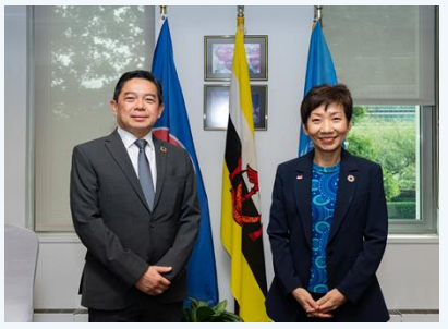
Minister Fu with Brunei's Minister at the Prime Minister's Office and Minister of Finance and Economy II Dato Amin Liew at Brunei's Mission in New York.