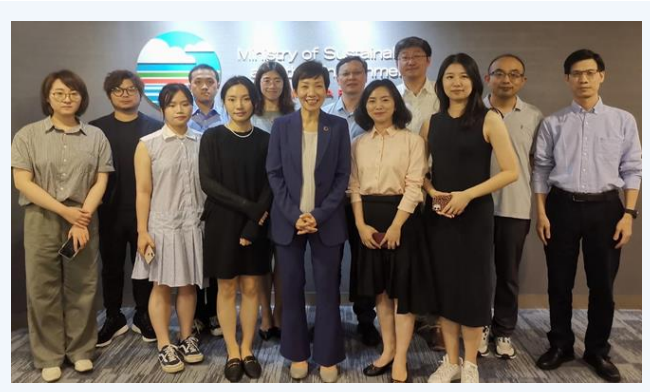
Minister Fu (centre, first row) with Chinese journalists at Singapore's Ministry of Sustainability and the Environment office.