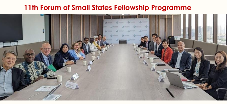
Minister Fu (centre-right) and officers from Singapore's Ministry of Sustainability and the Environment (right) and Permanent Representatives in Geneva and Vienna (left).

On 25 July 2023, Minister Fu met with the Permanent Representatives (PRs) from Geneva and Vienna. The