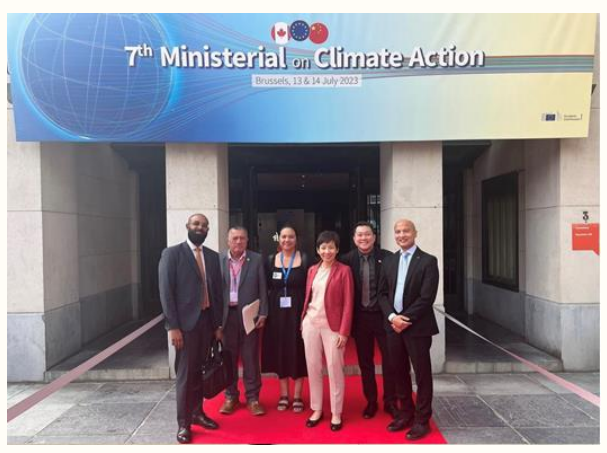
Minister Fu (centre) and officers from Singapore's Ministry of Sustainability and the Environment (right) at the 7th Ministerial on Climate Action.