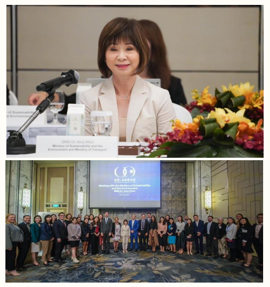
SMS Khor meeting with representatives of the US-ASEAN Business Council.