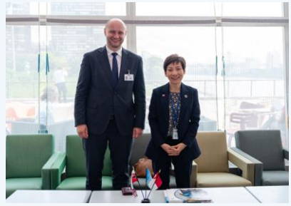
Minister Fu with Slovakia's Minister of Investments, Regional Development and Informatization of the Slovak Republic Peter Balík.