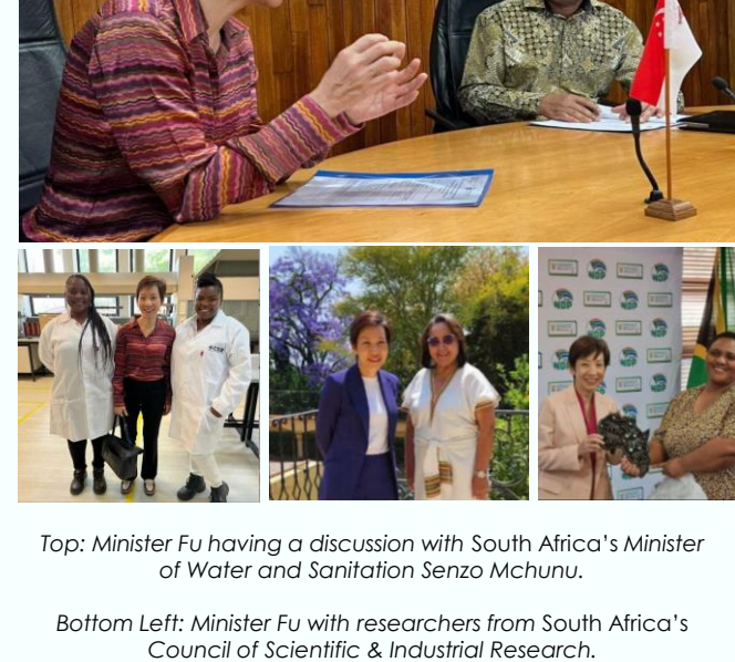
Bottom Right: Minister Fu with South Africa's Minister of Agriculture, Land Reform and Rural Development Thoko Didiza.

agriculture. Minister Fu also met academics and experts to discuss developments in South Africa, and visited the Council of Scientific & Industrial Research (CSIR) to understand South Africa's efforts in clean energy and water. Read Minister Fu's Facebook post here.