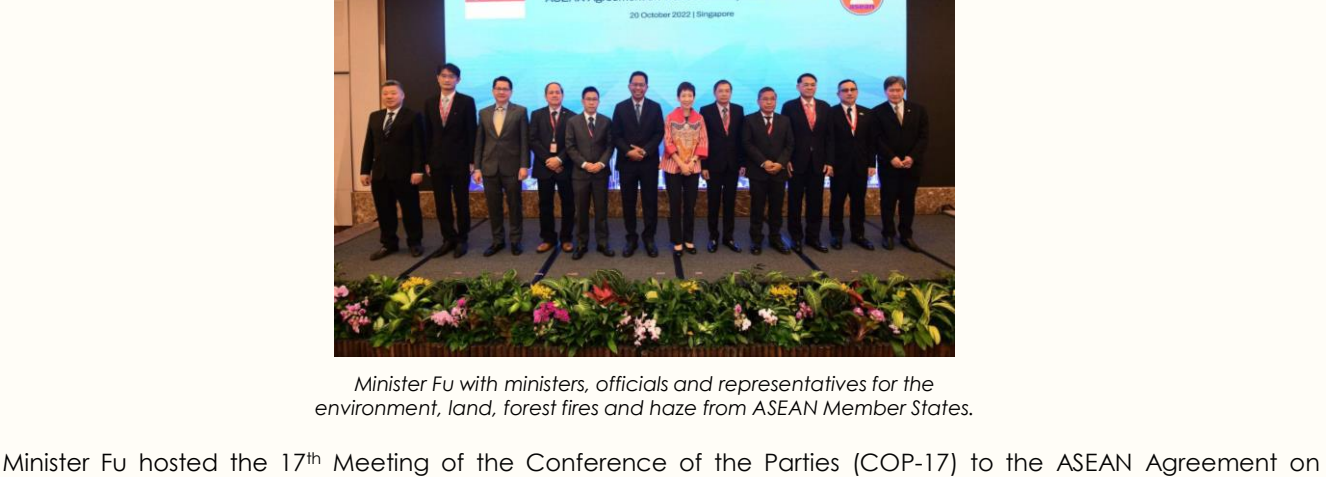
Transboundary Haze Pollution (AATHP) on 20 October 2022. It was ASEAN's first in-person meeting on transboundary haze pollution since the COVID-19 pandemic, which also coincided with the 20<sup>th</sup> anniversary of

Agreement on Transboundary Haze Pollution (AATHP)